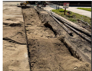
Crew backfilling the sewer main trench on Washington Street.

Construction notices have been given to affected residents. If restricted parking is necessary, "No Parking" signs will be posted 48 hours in advance of construction activities.