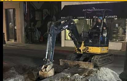
Excavating trench for lateral installation on 5th Street.

Typically, the replacement of waterlines will take 3-4 weeks from excavation of the trench to connecting to the existing line. Final paving is done when multiple sections of waterline have been replaced. Construction notices have been given to affected residents. For temporary water shutdowns in your area, notices will be given at least 48 hours in advance of construction activities.