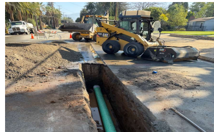
Crew installing a new sewer main on Palm Avenue.

Construction notices have been given to affected residents. If restricted parking is necessary, "No Parking" signs will be posted 48 hours in advance of construction activities.