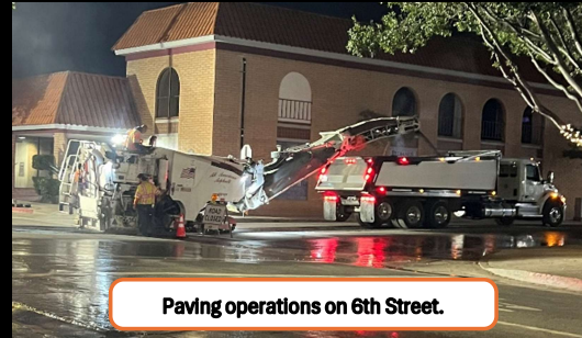
Paving operations on 6th Street.

Final paving has been completed. A limited amount of remaining work is currently being scheduled. If temporary water shutdown is necessary, notices will be provided at least 48 hours in advance of any construction activities in your area.