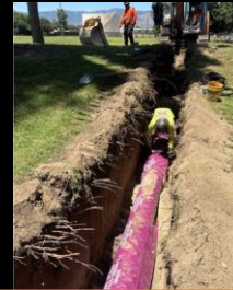
Installing 12" non-potable pipe at Texonia Park

Typically, the replacement of waterlines will take 3-4 weeks from excavation of the trench to connecting to the existing line. Final paving is done when multiple sections of waterline have been replaced. Construction notices have been given to affected residents. For temporary water shutdowns in your area, notices will be given at least 48 hours in advance of construction activities.