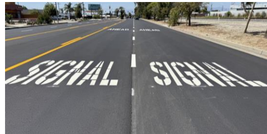
Completed pavement and striping work on Redlands Blvd.

Construction notices have been given to affected residents. If restricted parking is necessary, "No Parking" signs will be posted 48 hours in advance of construction activities.