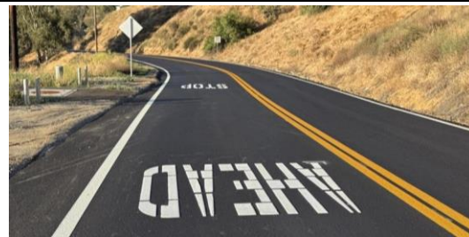
Completed pavement and striping work on Alessandro Rd.

Construction notices have been given to affected residents. If restricted parking is necessary, "No Parking" signs will be posted 48 hours in advance of construction activities.