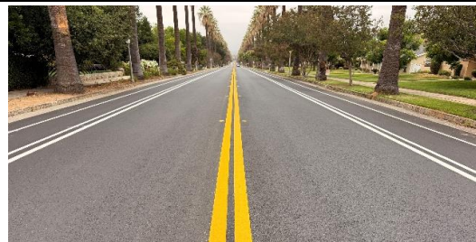
Completed pavement and striping work on Cajon St.

Construction notices have been given to affected residents. If restricted parking is necessary, "No Parking" signs will be posted 48 hours in advance of construction activities.